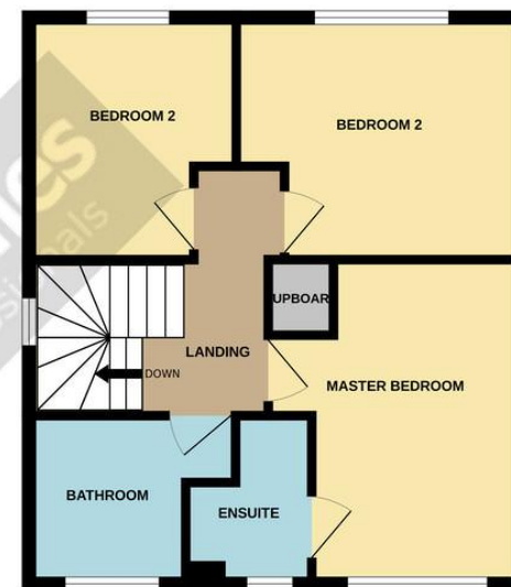
TOTAL FLOOR AREA : 94.3 sq.m. (1015 sq.ft.) approx.

Whilst every attempt has been made to ensure the accuracy of the floorplan contained here, measurements of doors, windows, rooms and any other items are approximate and no responsibility is taken for any error, omission or mis-statement. This plan is for illustrative purposes only and should be used as such by any prospective purchaser. The services, systems and appliances shown have not been tested and no guarantee as to their operability or efficiency can be given. Made with Metropix ©2025