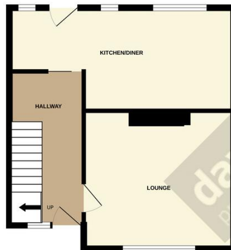
GROUND FLOOR 38.0 sq.m. (409 sq.ft.) approx.