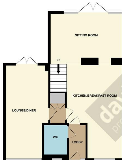
GROUND FLOOR 60.6 sq.m. (653 sq.ft.) approx.