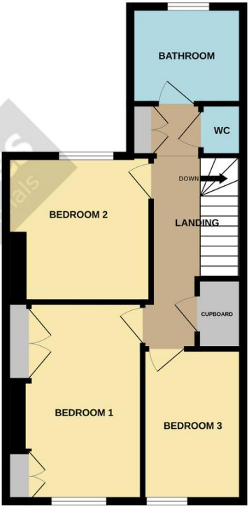
1ST FLOOR 45.6 sq.m. (491 sq.ft.) approx.