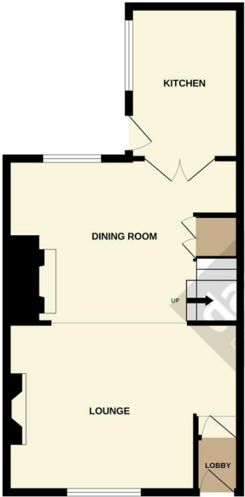
GROUND FLOOR 44.1 sq.m. (474 sq.ft.) approx.