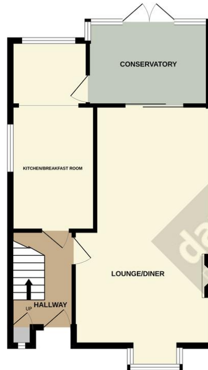
GROUND FLOOR 51.6 sq.m. (555 sq.ft.) approx.