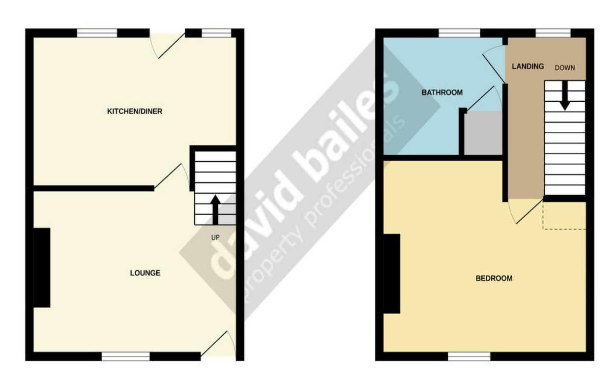
TOTAL FLOOR AREA: 56.7 sq.m. (610 sq.ft.) approx.

Whilst every attempt has been made to ensure the accuracy of the floorigan contained here, measurements of doors, windows, rooms and any other items are approximate and no responsibility is taken for any error, omission or mis-ratement. This plan is for illustrative purposes only and should be used as such by any prospective purchaser. The services, systems and appliances shown have not been tested and no guarantee as to their operability or efficiency can be given. Made with Metropix ©2022