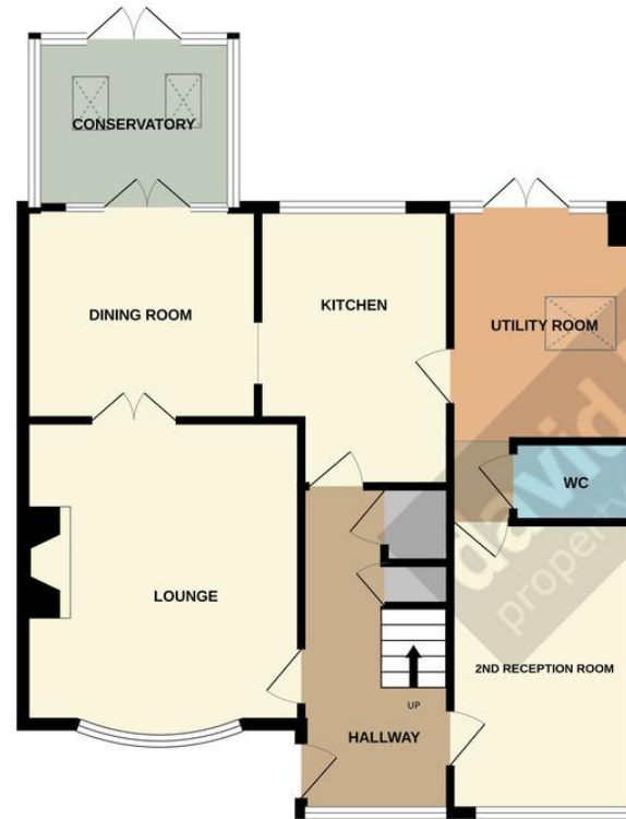
GROUND FLOOR 75.4 sq.m. (812 sq.ft.) approx.