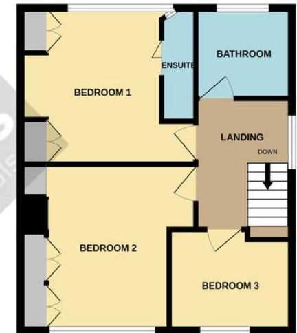
TOTAL FLOOR AREA: 119.0 sq.m. (1281 sq.ft.) approx.

Whilst every attempt has been made to ensure the accuracy of the floorplan contained here, measurements of doors, windows, rooms and any other items are approximate and no responsibility is taken for any error, omission or mis-statement. This plan is for illustrative purposes only and should be used as such by any prospective purchaser. The services, systems and appliances shown have not been tested and no guarantee as to their operability or efficiency can be given. Made with Metropix ©2023