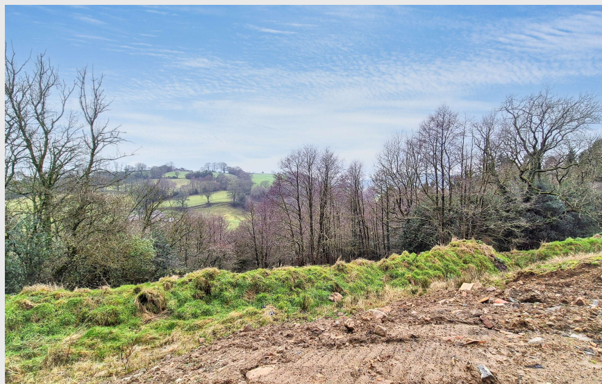
Woodlands, 401 Gisburn Rd Blacko. B92 6LS CD/CJ/110924

Selling your house? We will be happy to provide free valuation and marketing advice, without obligation - please ask for details