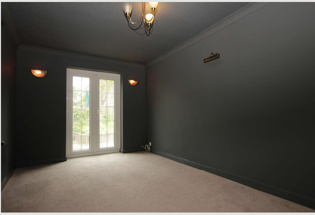
BEDROOM FOUR: 3.5m x 2.3m (11'4" x 7'5").