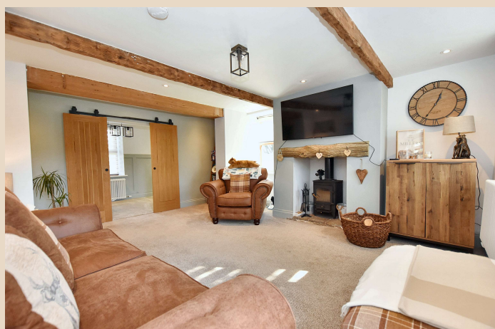
HONEYWELL SELECT, SELLING PROPERTIES OF DISTINCTION

honeywellselect.co.uk Clitheroe 01200 426041