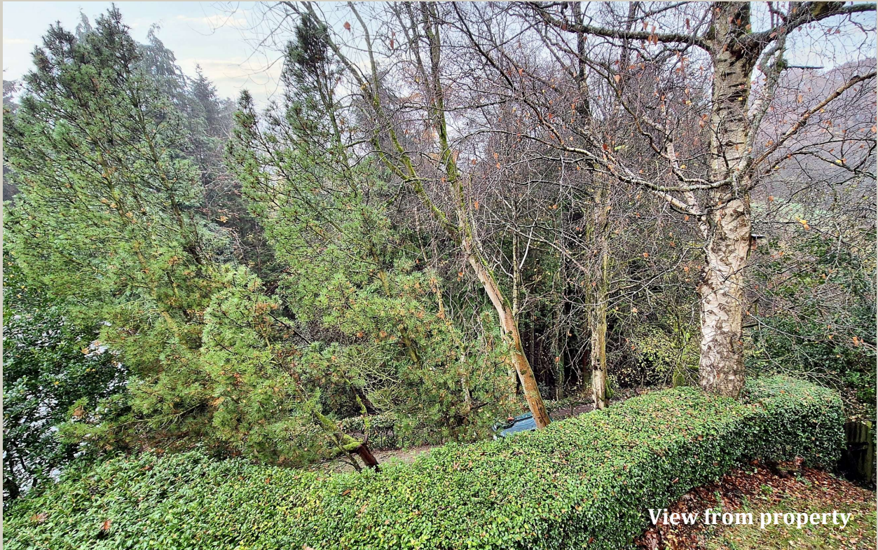
View from property