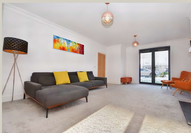
HONEYWELL SELECT, SELLING PROPERTIES OF DISTINCTION