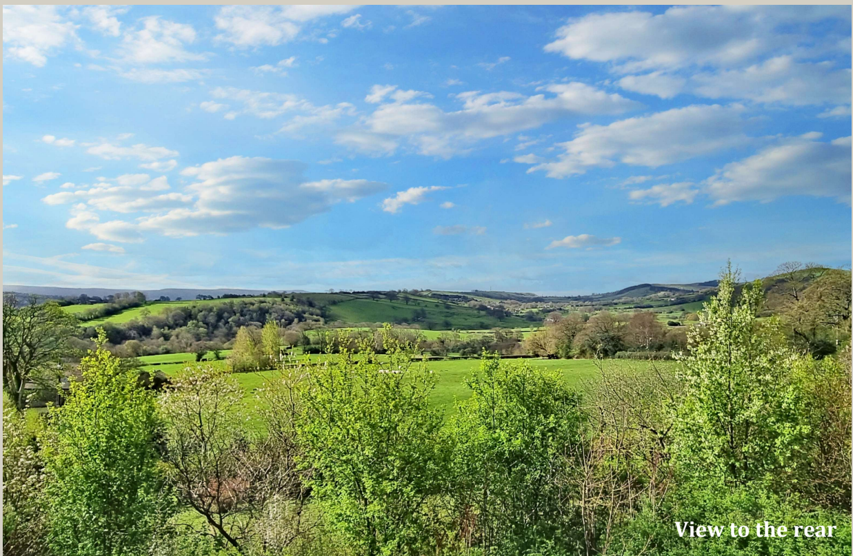
View to the rear

Please note: These particulars are produced in good faith, but are intended to be a general guide only and do not constitute any part of an offer or contract. No person in the employment of Honeywell Estate Agents Ltd has any authority to make any representation or warranty whatsoever in relation to the property. Photographs are reproduced for general information and do not imply that any item is included for sale with the property.