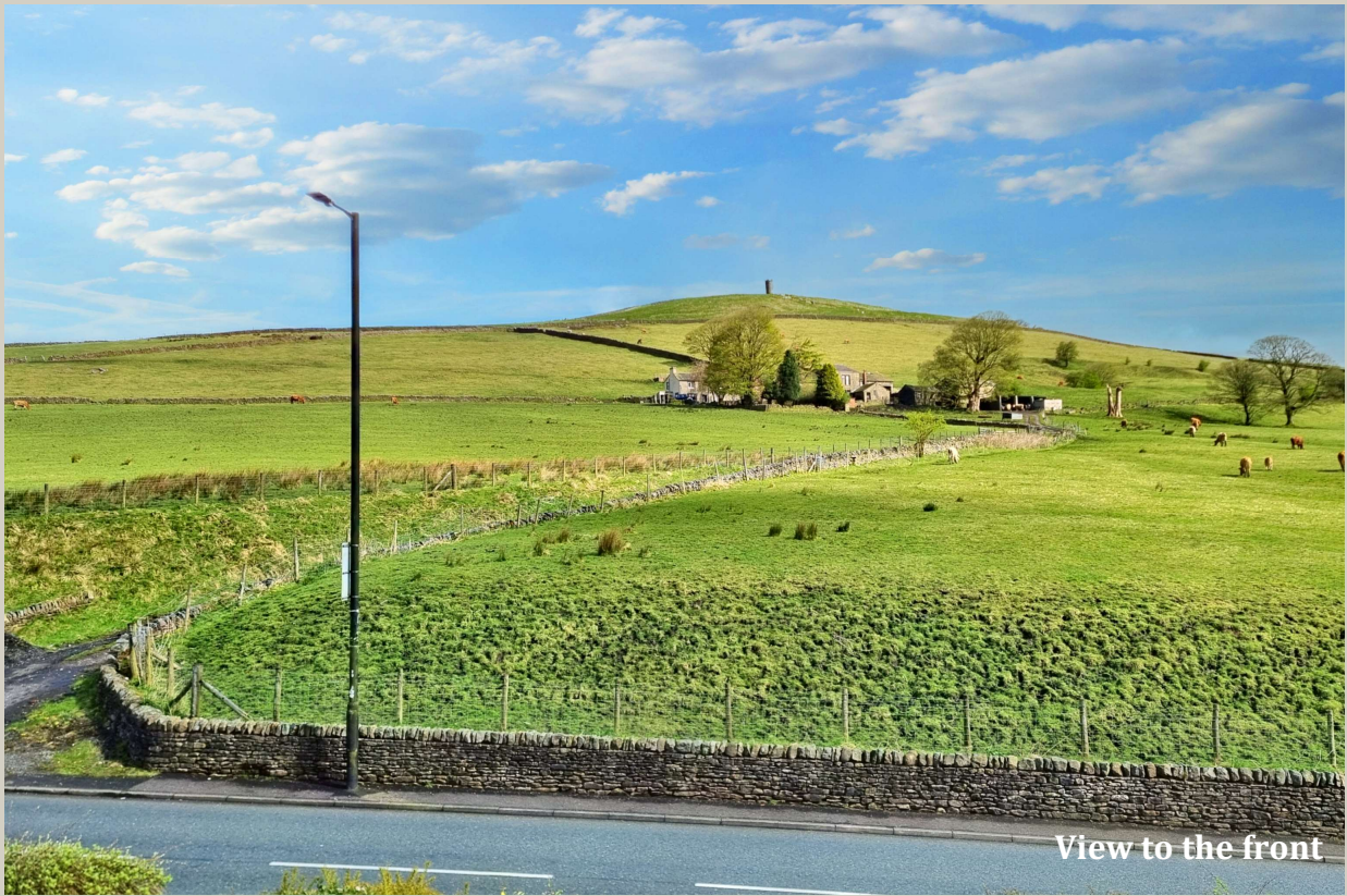
View to the front