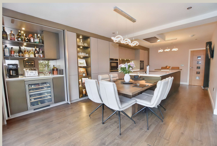
HONEYWELL SELECT, SELLING PROPERTIES OF DISTINCTION