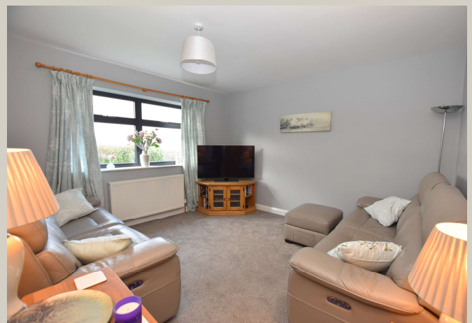
HONEYWELL SELECT, SELLING PROPERTIES OF DISTINCTION