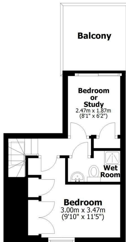
First Floor Approx. 20.7 sq. metres (223.3 sq. feet)

This floor plan is for illustrative purposes and only provides an outline representation. Produced for North Oxford Property Services. Plan produced using PlanUp.