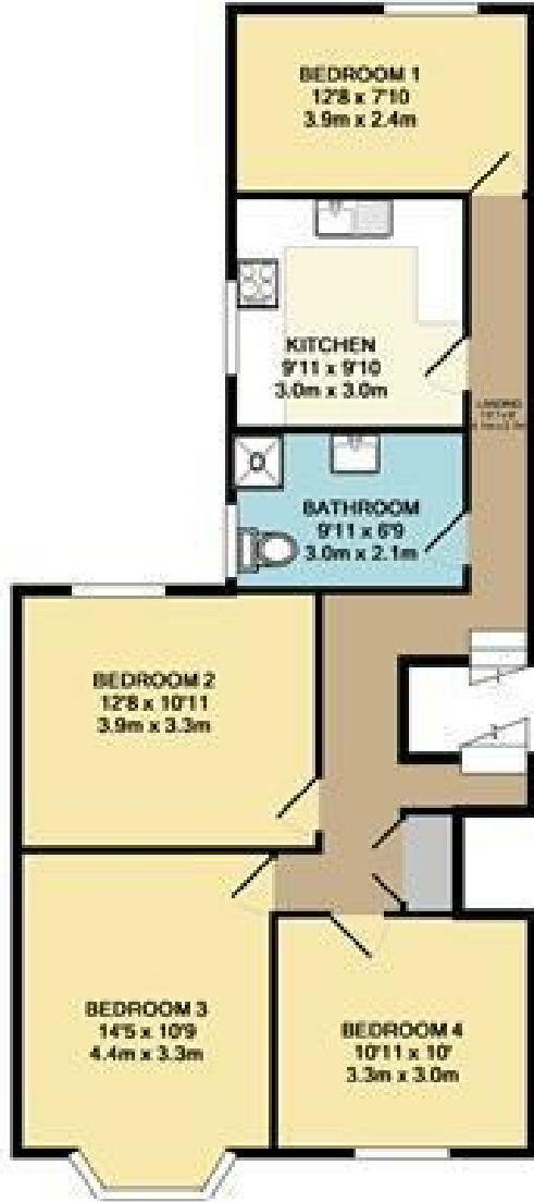
1ST FLOOR APPROX. FLOOR AREA 73.7 SQ.M. (794 SQ.FT.)