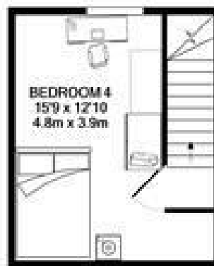
2ND FLOOR APPROX. FLOOR AREA 203 SQ. FT. (18.8 SQ.M.)

TOTAL APPROX. FLOOR AREA 912 SQ. FT. (84.8 SQ.M.) Made with Metreco 02020