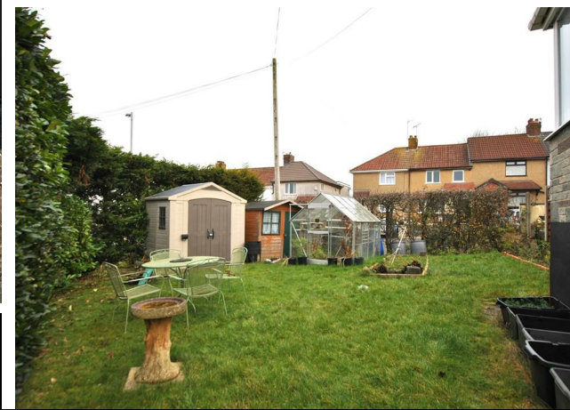
Cobweb Corner Chessington Avenue, Bristol, BS14