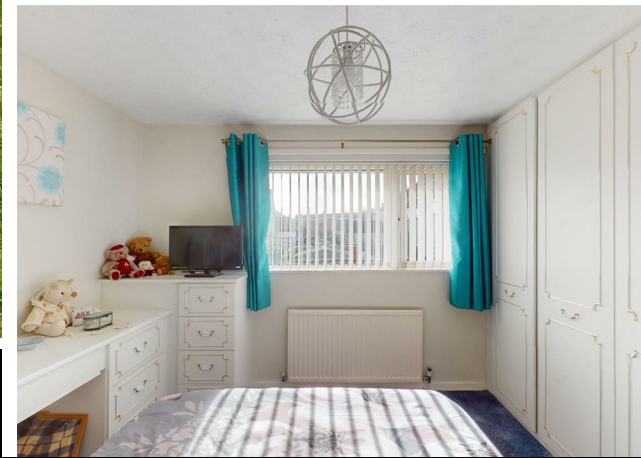
Bittle Mead, Hartcliffe