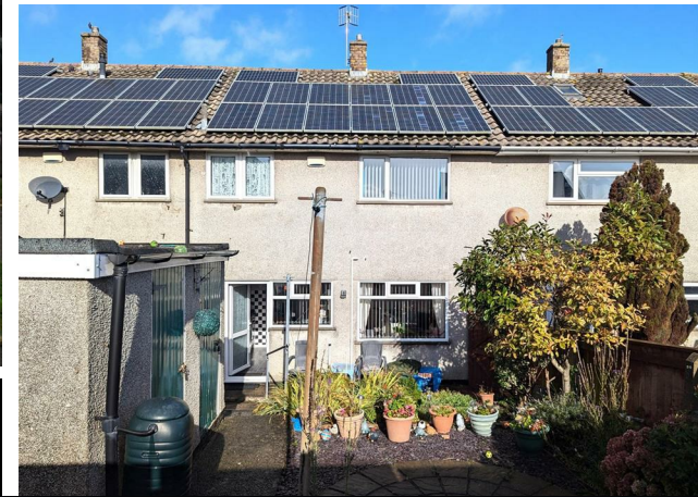
Bittle Mead, Hartcliffe