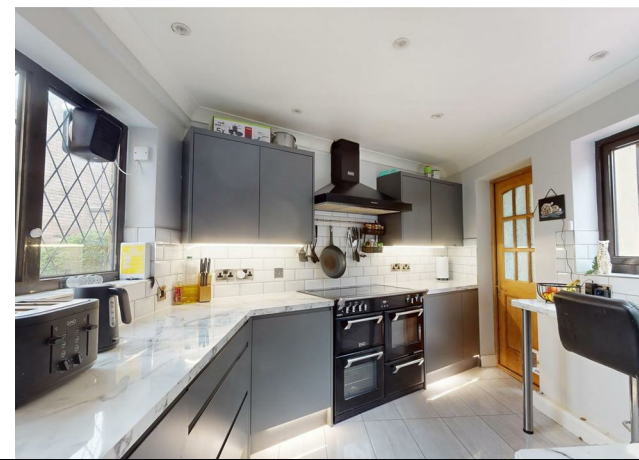
Little Birch Croft, Whitchurch