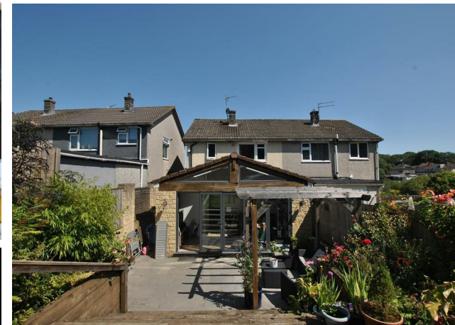
Wells Close, Whitchurch