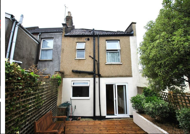
Fairfield Place, Southville