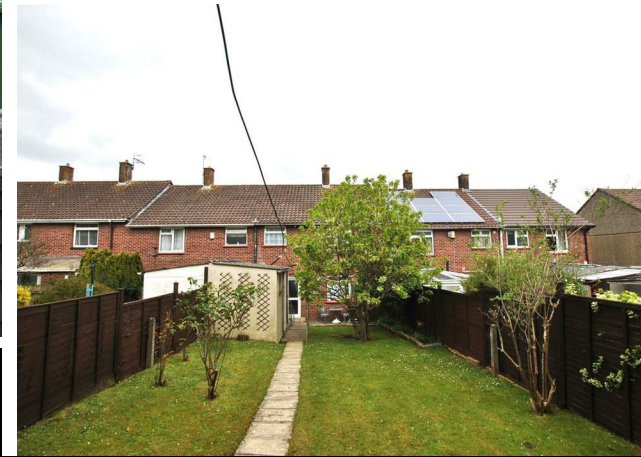
Lampton Grove, Hartcliffe