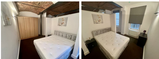
Bedroom 10'0" x 16'4" (3.05 x 5.00)

Double bedroom with large wardrobe space.