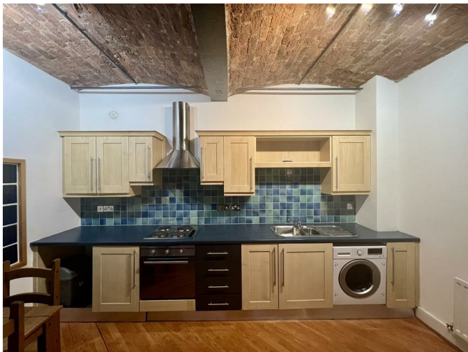
Kitchen 14'3" x 10'0" (4.35 x 3.05)

Open plan kitchen with plenty of space, lots of wall and base unit storage and worktop space.