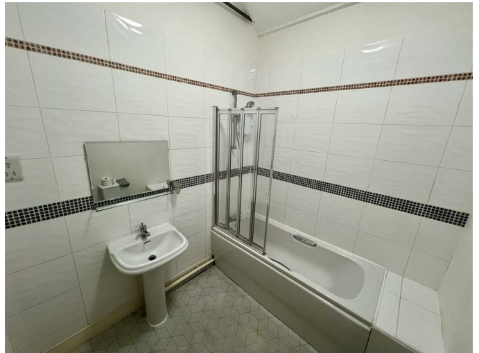
Bathroom 9'5" x 6'10" (2.88 x 2.10)

Good sized bright bathroom with white part tiling and vinyl modern flooring with a white suite.