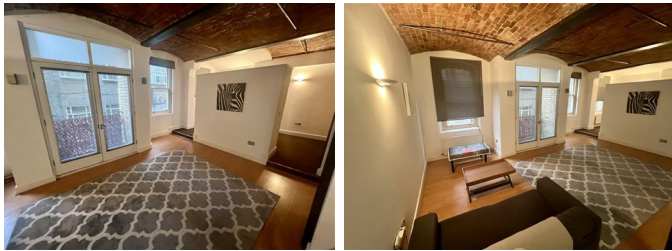
Lounge 17'10" x 20'11" (5.45 x 6.40)

Spacious open plan lounge with access to your own private balcony. Laminate flooring throughout and a bright neutral decor.