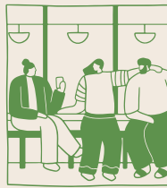
Lounge areas & work spaces