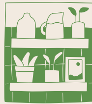
Freedom to decorate