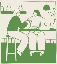
Free superfast broadband