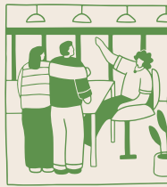
On-site and maintenance team