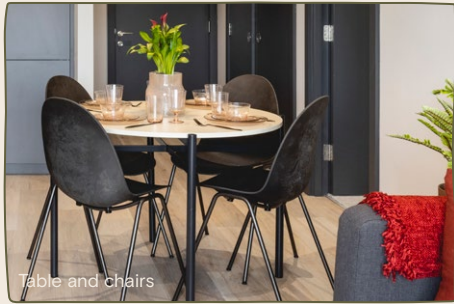
Table and chairs