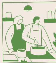
Private dining room