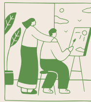
Regular resident events

Want to book a viewing or need to find out more? Contact our team today on +44 (0)1273 091 196.