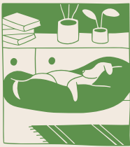
Pet friendly apartments