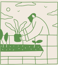
Three roof gardens & allotments