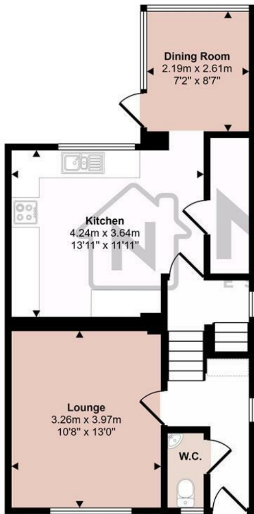
Ground Floor Approx 47 sq m / 511 sq ft

Approx Gross Internal Area 90 sq m / 964 sq ft