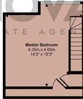
First Floor Approx 21 sq m / 230 sq ft