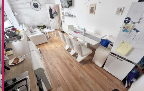
Nickmar Court, Flat 3, 137-139 New Bedford Road, Luton, Beds, LU3 1LF

Discover your ideal home in the heart of Luton with this charming One bedroom flat in Nickmar Court, just off New Bedford Road. This spacious property features a large bedroom, low service charge and ground rent, and off road allocated parking. Its prime location offers quick access to Luton Town Center, the train station, and The Mall shopping centre. Enjoy picturesque views of Wardown Park, located just across the road, and benefit from the convenience of a chain free sale. Perfect for first time buyers, professionals, or investors, this flat combines comfort, affordability, and outstanding features in a sought after area. Contact us today to arrange a viewing!