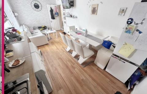
Nickmar Court, Flat 3, 137-139 New Bedford Road, Luton, Beds, LU3 1LF

Discover your ideal home in the heart of Luton with this charming One bedroom flat in Nickmar Court, just off New Bedford Road. This spacious property features a large bedroom, low service charge and ground rent, and off road allocated parking. Its prime location offers quick access to Luton Town Center, the train station, and The Mall shopping centre. Enjoy picturesque views of Wardown Park, located just across the road, and benefit from the convenience of a chain free sale. Perfect for first time buyers, professionals, or investors, this flat combines comfort, affordability, and outstanding features in a sought after area. Contact us today to arrange a viewing!