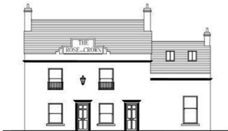
SOUTH ELEVATION SCALE 1:100