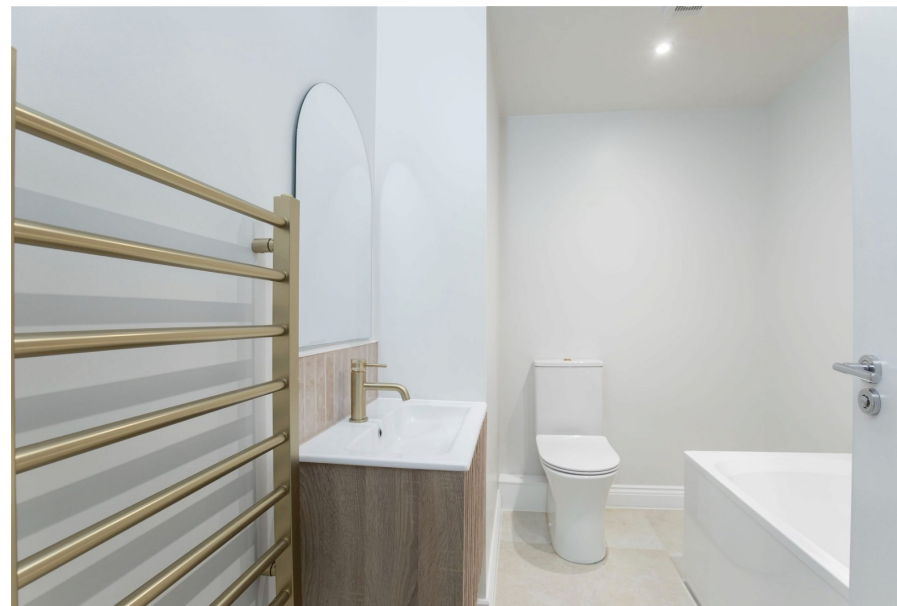
SECOND FLOOR- APARTMENT 4 643 sq.ft. (59.7 sq.m.) approx.

Nestled in the centre of Cheltenham is this superb two bedroom apartment situated in the brand new Segraves Corner development that contains four apartments which has been tastefully finished throughout.