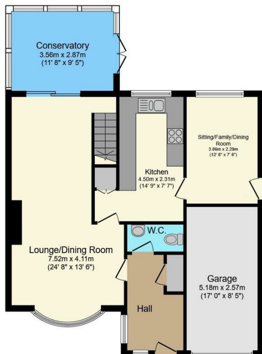
Ground Floor Floor area 86.5 sq.m. (931 sq.ft.)