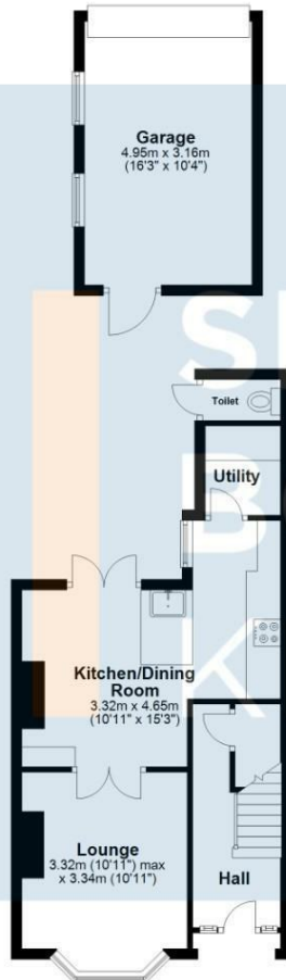
Ground Floor Approx. 54.6 sq. metres (588.0 sq. feet)