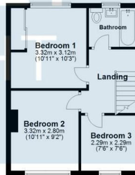
First Floor Approx. 34.9 sq. metres (375.8 sq. feet)

Bedroom 1 3.32m x 3.12m (10'11" x 10'3")