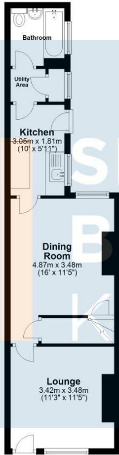
Ground Floor Approx. 40.4 sq. metres (434.8 sq. feet)