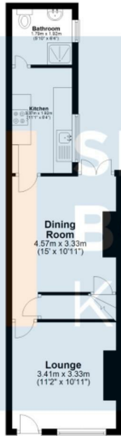
Ground Floor Approx. 37.2 sq. metres (400.2 sq. feet)