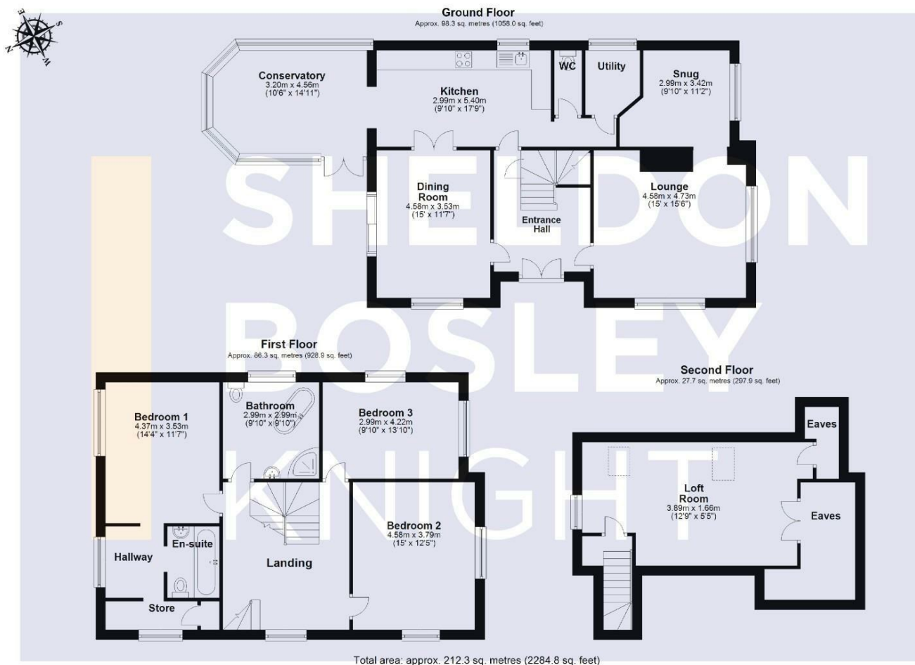
DISCLAIMER - Floor plans shown are for general guidance only. Whilst every attempt has been made to ensure that the floorplan measurements are as accurate as possible, they are for illustrative purposes only