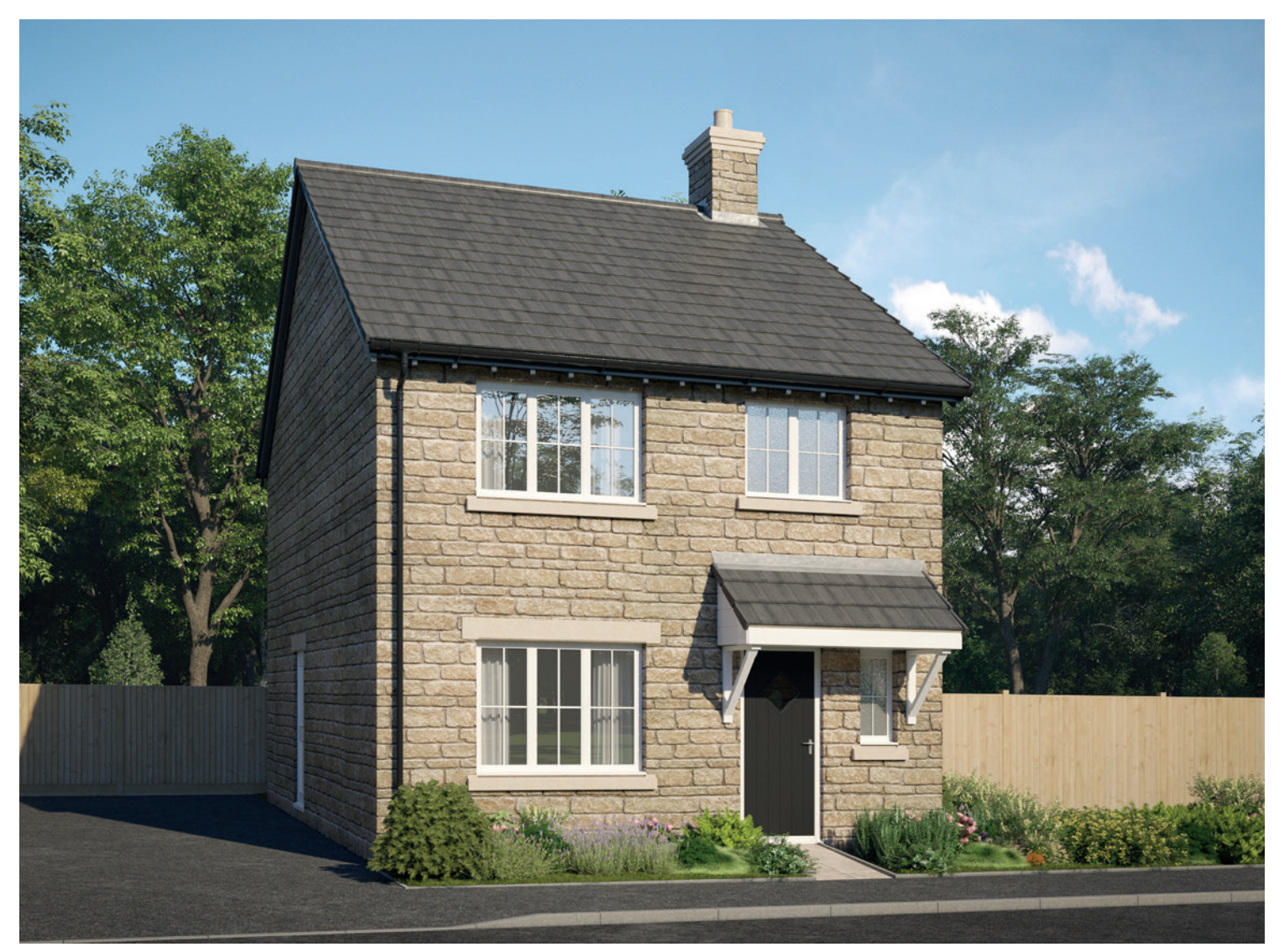
Please note: Chimneys are plot specific. Stone course may differ from shown. Please see Sales Advisor for details.