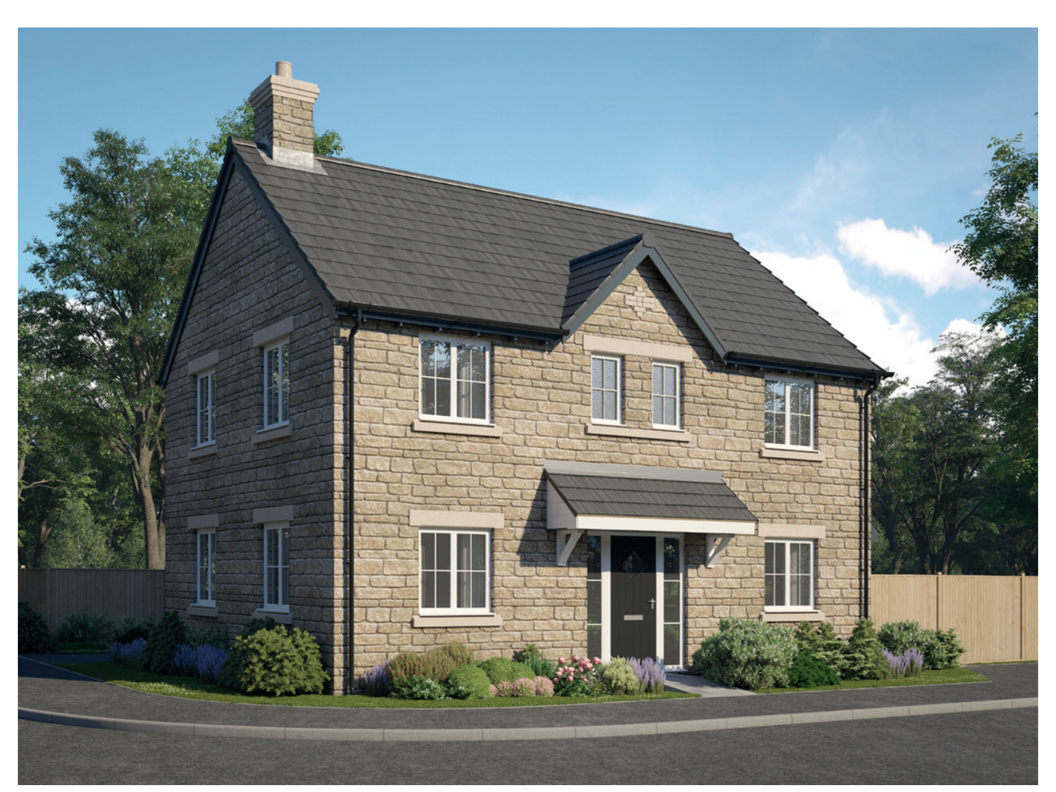
Please note: Chimneys are plot specific. Stone course may differ from shown. Please see Sales Advisor for details.