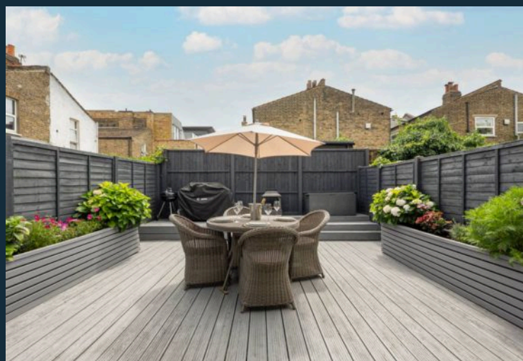
1 Khartoum Road, London £575,000 Share of Freehold