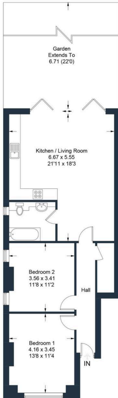
Illustration for identification purposes only, measurements are approximate, not to scale. Produced by Haboodle Estate Agents (ID1236807)

Approximate Gross Internal Area = 76.3 sq m / 821 sq ft