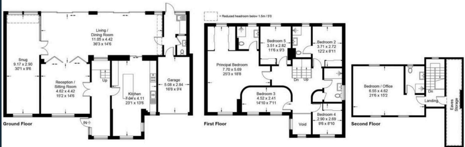
Illustration for identification purposes only, measurements are approximate, not to scale. Fourlabs.co © (ID1176688)

Approximate Gross Internal Area = 316.3 sq m / 3405 sq ft (Including Garage, Eaves Storage & Excluding Void)