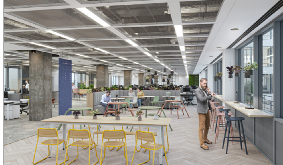
▲ First Floor CAT B CGI

New Energy Efficient VRF Air Conditioning