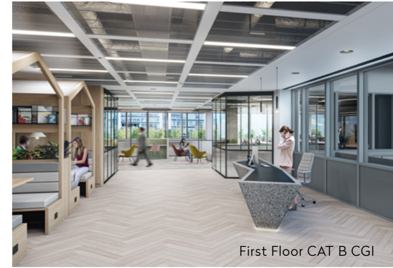
First Floor CAT B CGI