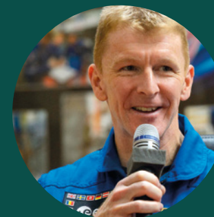
Major Tim Peake Astronaut

“Harwell Campus is an established and important hub for the very best of European space and science technology. The European Space Agency’s decision to base itself there underlines the quality of the facility and shows the high regard that the industry has for Harwell. I’m delighted to see it first hand and be part of its success. It’s always exciting to visit Harwell Campus, I can’t wait to be back.”