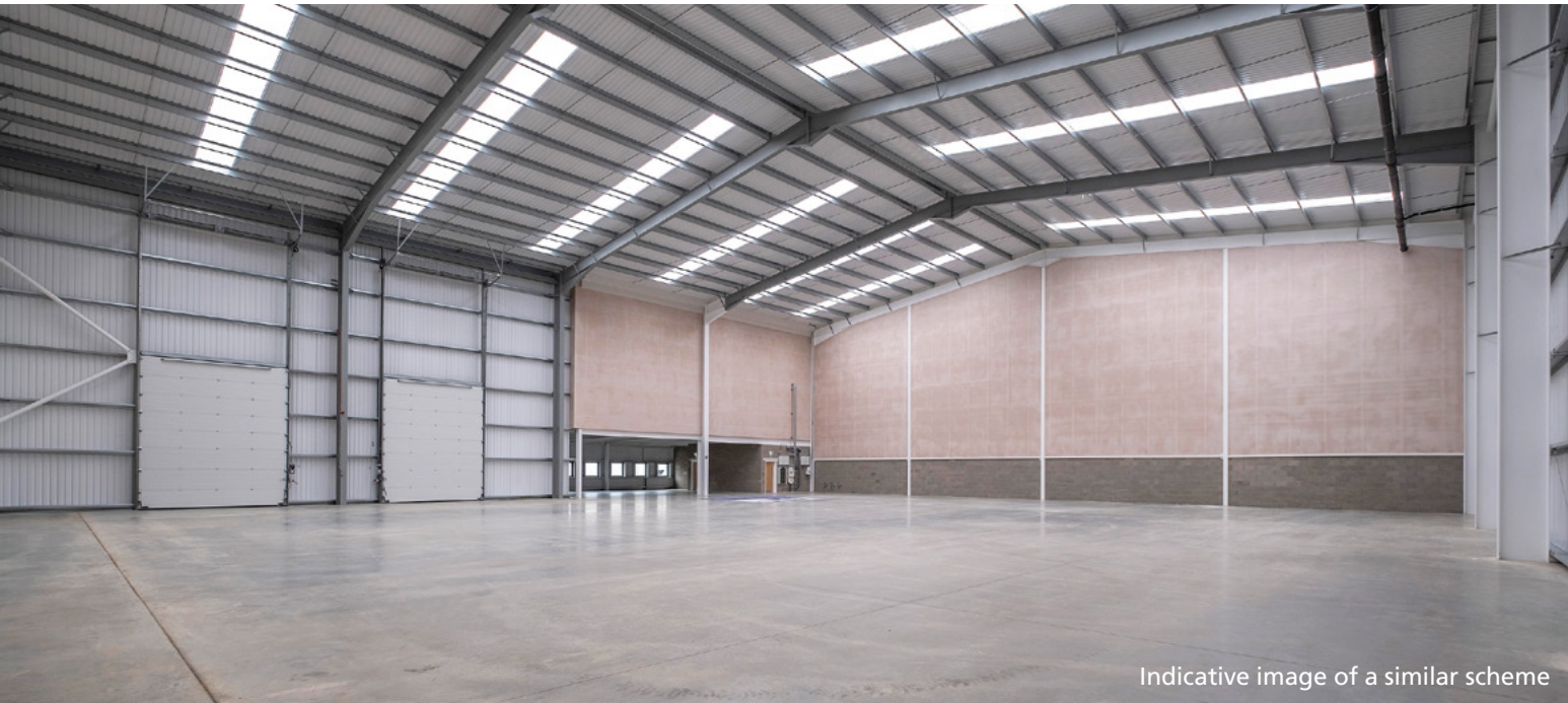
Indicative image of a similar scheme