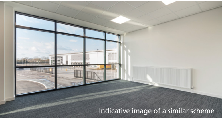
Indicative image of a similar scheme