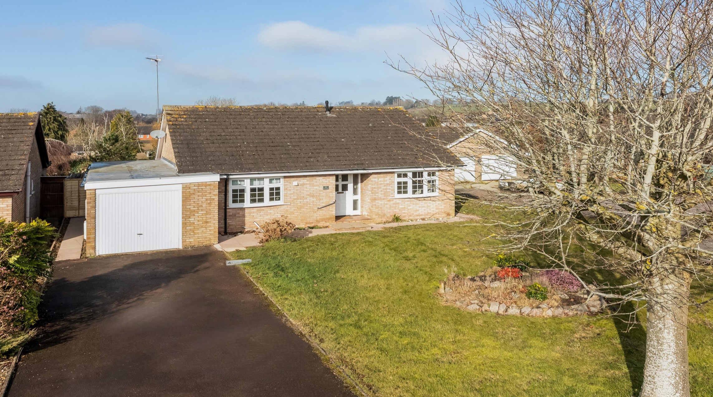
8 Cherrys Close, Bloxham Banbury, Oxon, OX15 4TD