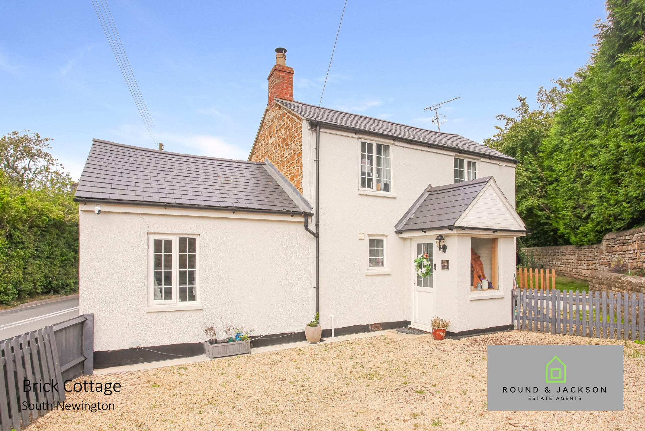
Brick Cottage South Newington