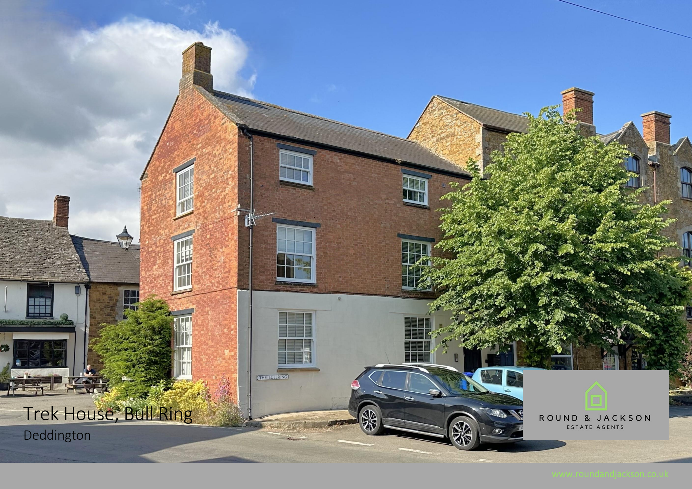
Trek House, Bull Ring Deddington