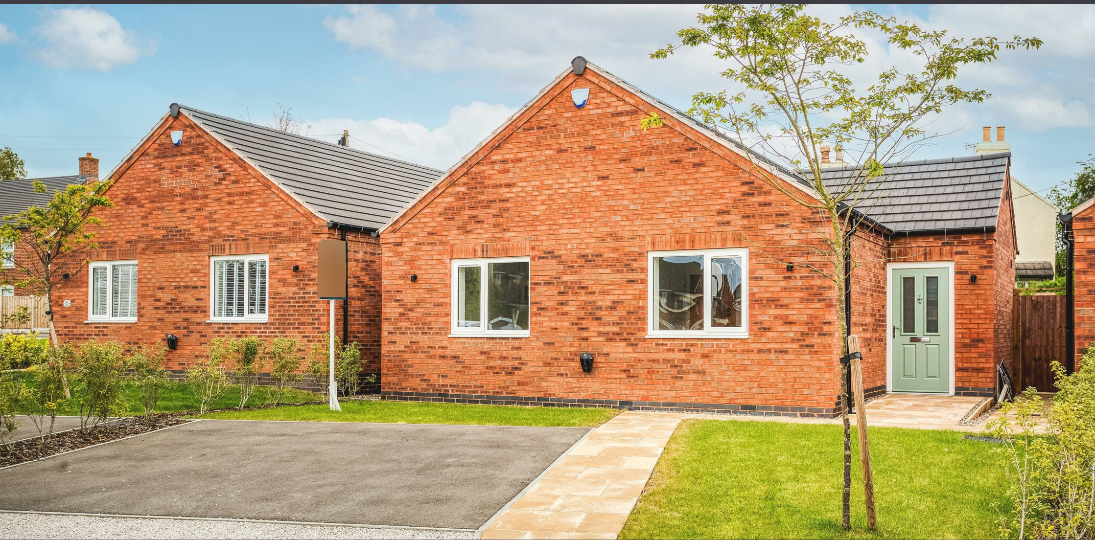
The Chimes Derby Road, Derby, DE65 5FP Guide price £349,999