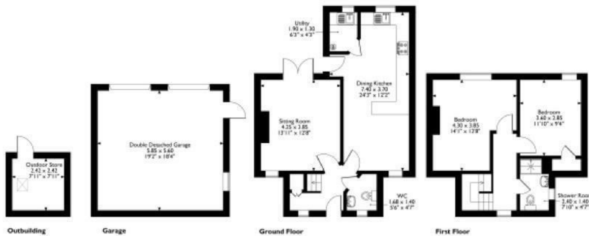
Hillside Cottage Approximate Gross Internal Area 124 Sq M / 1335 Sq Ft

Please note that the location of doors, windows and other items are approximate and this floorplan is to be used for illustrative purposes only. Unauthorized reproduction is prohibited.