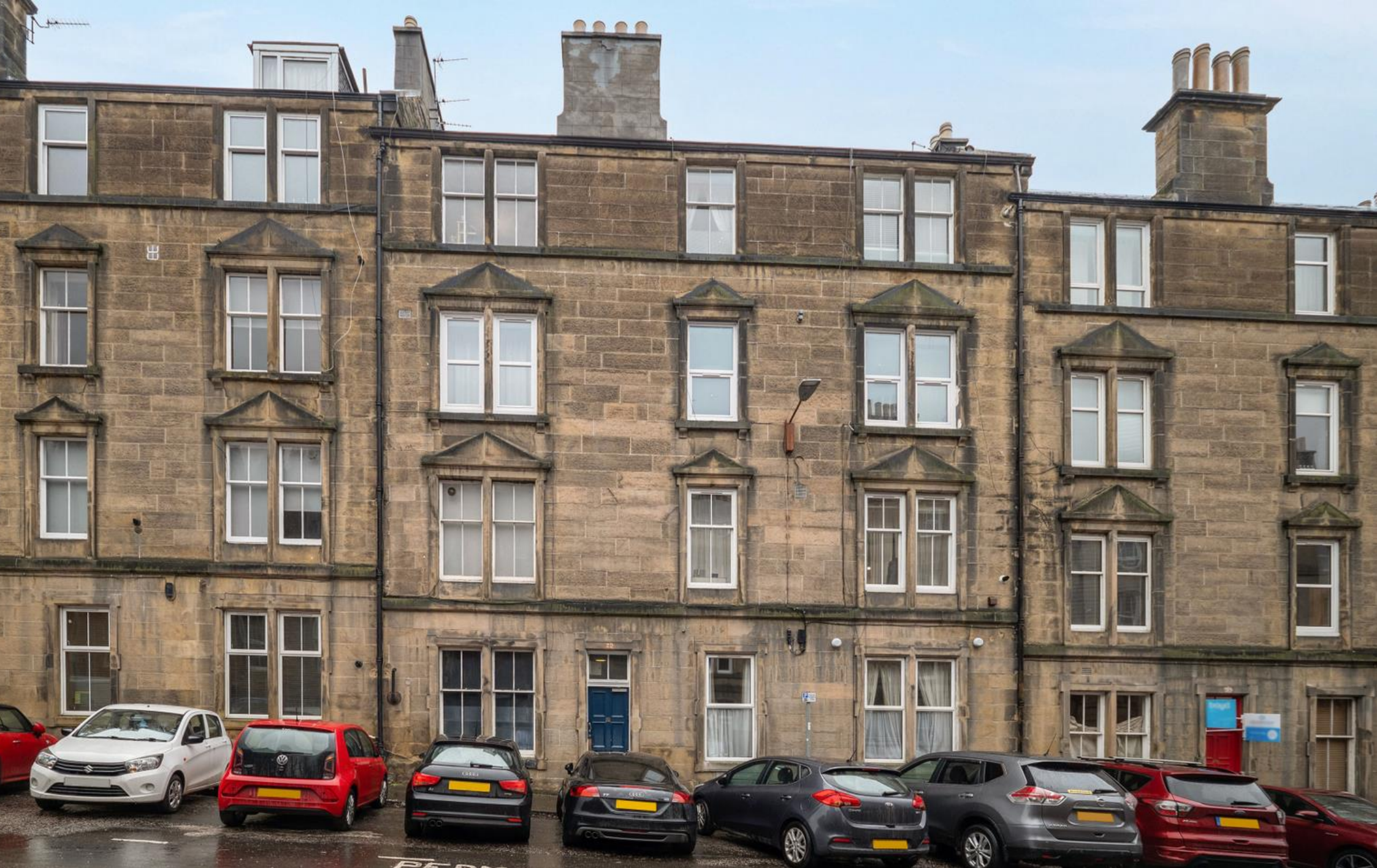
Dean Park Street, Stockbridge, Edinburgh